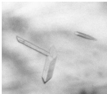
Figure 1 Crystals of CLP (approximate dimensions 0.05 \times 0.07 \times 0.3 mm).

containing 100 \mu\text{g ml}^{-1} ampicillin. The next day, 10 ml of the overnight culture was added to 1000 ml LB medium. When the culture density reached 0.6–0.7 ( A_{600} ), induction with 1 \text{ mmol l}^{-1} isopropyl- \beta -D-thiogalactopyranoside (IPTG) was performed.